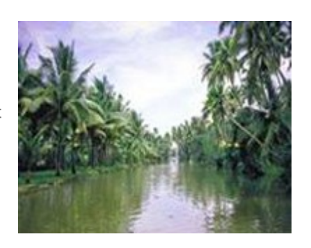
DAY 02 COCHIN - MUNNAR

Arrive Cochin airport / railway stn & Transfer to hotel. City tour of Old Cochin visiting the Dutch Palace (closed on Fridays) Jewish Synagogue (Closed on Friday afternoon and Jewish Holidays) Jew Street, St. Francis Church (Closed till 1100hrs on Sundays) etc. Return to hotel. Overnight at Hotel